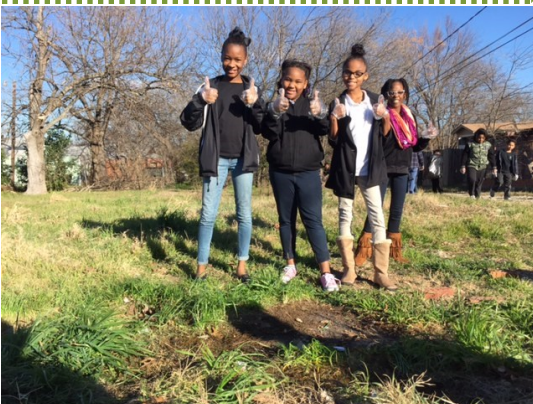
AFTER TRASH & TREATS!