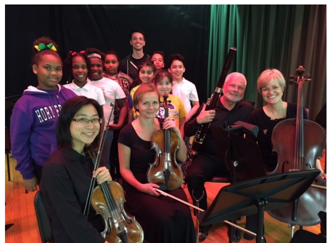
B Sharp Chamber Strings & the Hall Ensemble