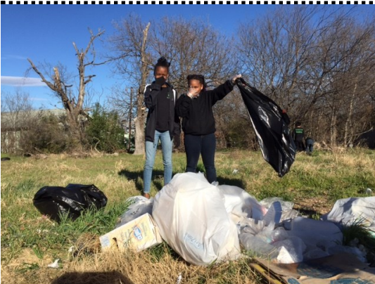
BEFORE TRASH & TREATS